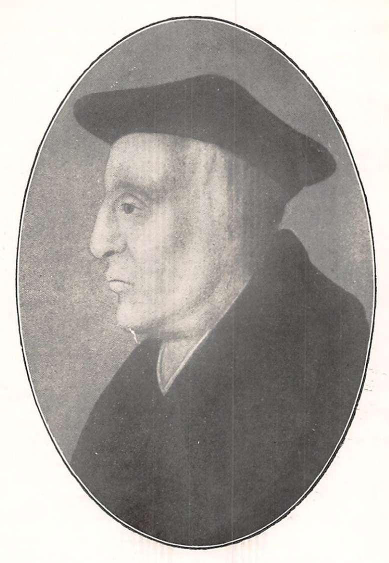
ROGER BACON: FORERUNNER OF THE INTELLECTUAL REVIVAL OF THE WEST 1214—1292